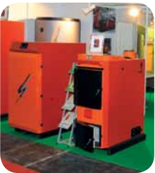
ENGRA Energy Fair