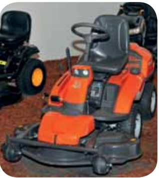
KOGRA Fair of Municipal Services, Landscaping and Ecology