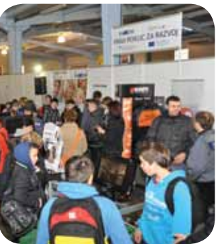
POS Pomurje Craft- Business Fair