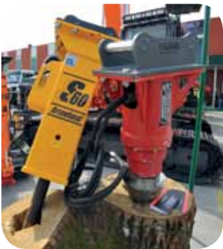
MEGRA Construction Fair